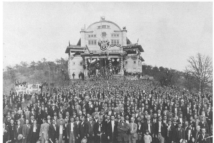
Chautauqua Assembly Hall ca. 1906