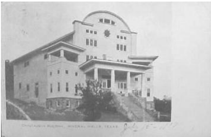
Postcard of Chautauqua Assembly Hall at Mineral Wells ca. 1907